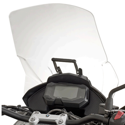
KFB5126 Fairing upper bracket to be mounted behind the windshield to install KS920M, KS920L, KS95KIT and GPS-Smartphone holder

For KS920M, KS920L, KS952B, KS953B, KS954B, KS955B, KS956B, KS957B, KS958B, KS95KIT