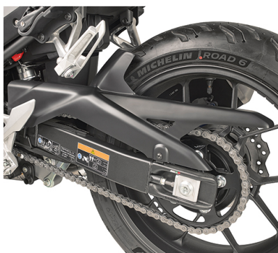
KMG1203 Specific ABS mudguard, black colour