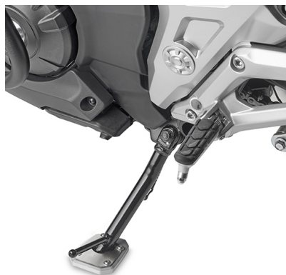
ES1192K Specific support in aluminium and stainless steel to widen the surface support area of the original side stand