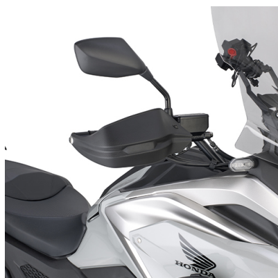
KHP1192B Specific, technopolymer, black hand protectors