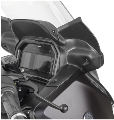
DF2178K Pair of black side deflectors