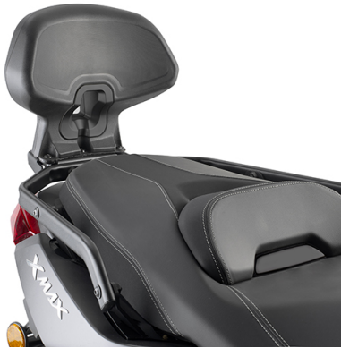
KTB2167A Specific backrest

it cannot be mounted if rack and case are installed